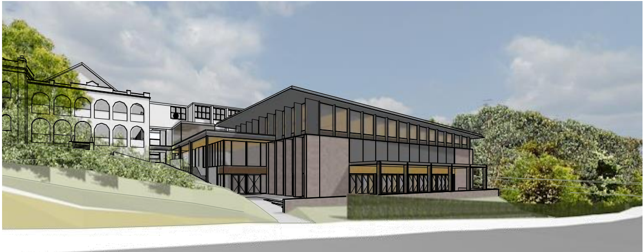
Figure 2: Photomontage of the proposed school hall and entry forecourt as viewed from Crebert Street.

Photomontages of the proposed development are included in Figures 2 and 3 below.