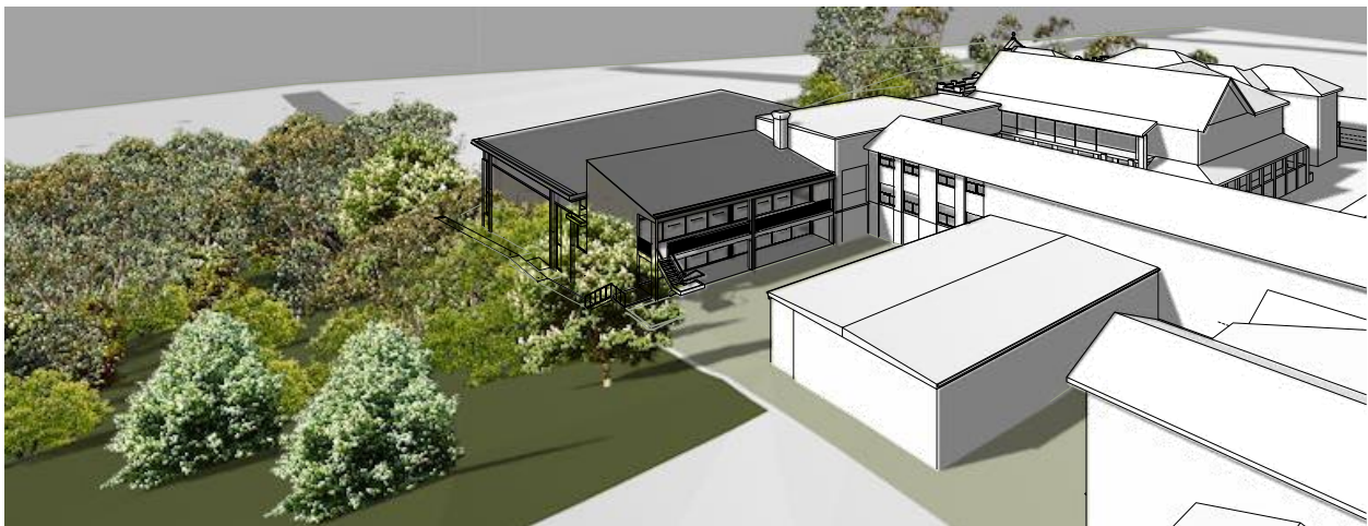
Figure 3: Photomontage of the proposed classroom building and school hall.

The proposal will not change the operation and management of the school. The location and times of pedestrian access to and from the site will also not change. Vehicular access will however be removed from the Crebert Street entrance point.