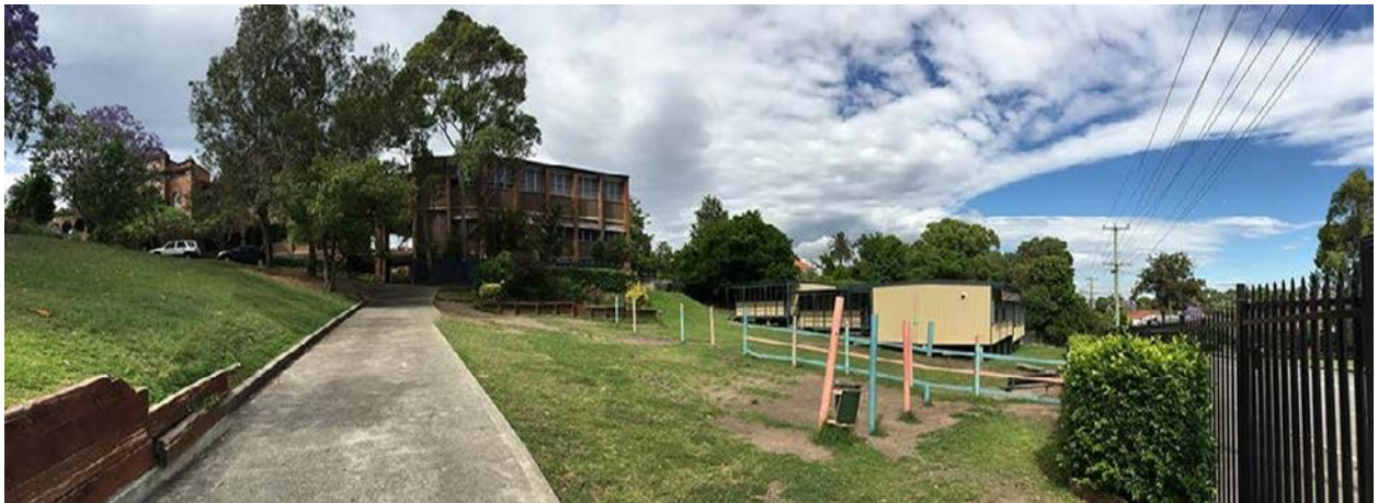
Photo 1: View towards the western portion of the development site showing a classroom building (to be retained) and the demountable classrooms that are to be demolished.